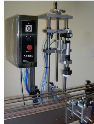
Capper fitted with Standard rubber cone head